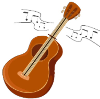
Guitar with short string